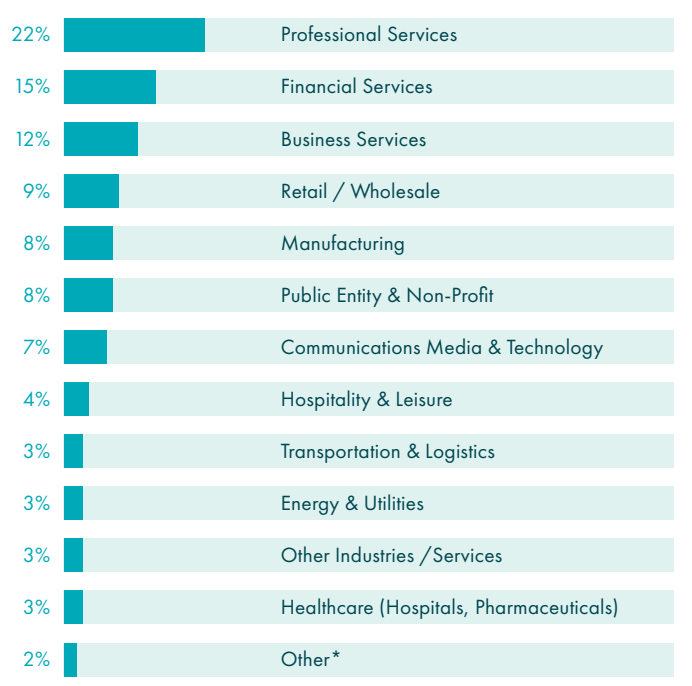
Fig 2 Cyber Claims received by AIG EMEA (2018) - By industry

*Food & Beverage, Construction, Education Note: Figures may not add up to 100% due to rounding